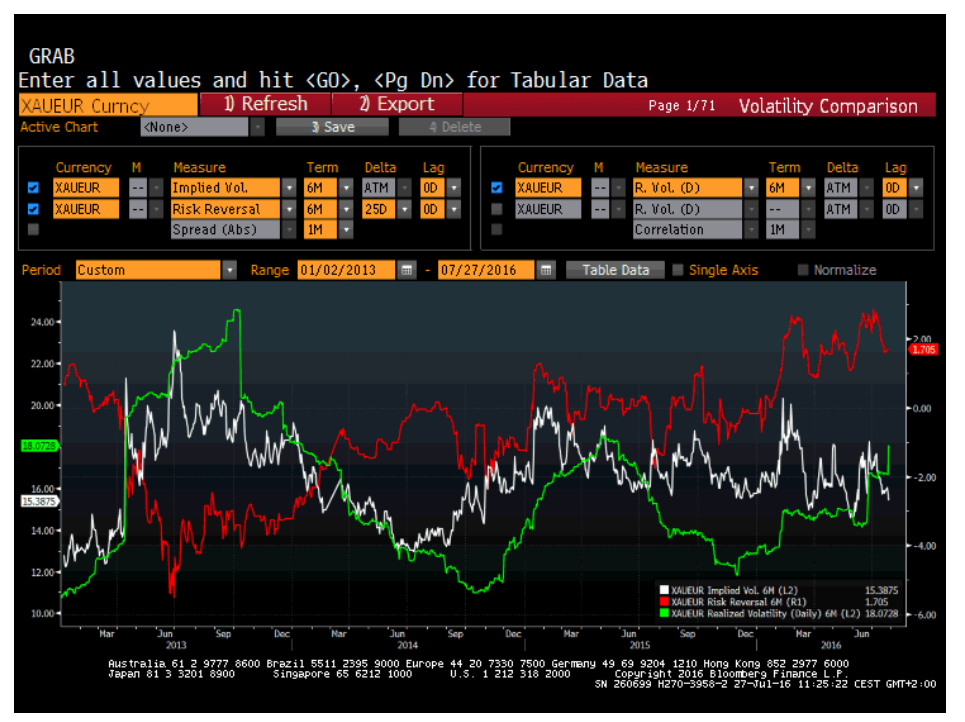
Click chart to enlarge

From a fundamental point of view we have seen the strongest inflows into the Gold ETFs for a long time since the beginning of this year, as people were looking for safe haven investments. That actually could also pose a risk to my long Gold idea, should investors all of a sudden reverse these inflows. Another Gold supportive is the general low or negative rate environment, as it makes holding Gold comparably cheap. Investors often cited Gold as not being attractive in the past as it doesn't pay any interest.